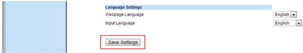
Figure 3. Save your Changes

Congratulations! You have configured your Aastra Phone to listen for Multicast Pages.