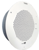
011398 SIP Talk-Back Speaker