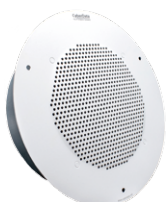
011121 Auxiliary Analog Speaker