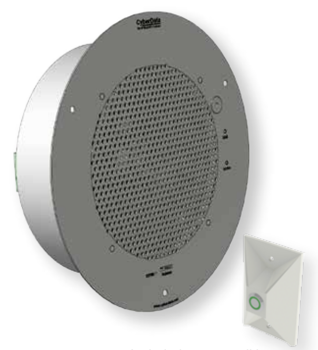
Included remote call button: 011185, RAL 9003