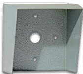
011188 Outdoor Intercom Shroud