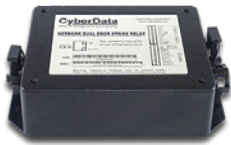
011375 Network Dual Door Strike Relay