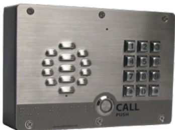
011214 SIP Outdoor Intercom with Keypad