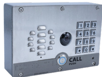
011414 SIP h.264 Video Outdoor Intercom with Keypad