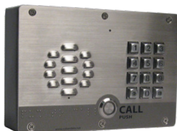
011310 Singlewire InformaCast Outdoor Intercom with Keypad