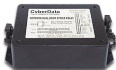
011375 Network Dual Door Strike Relay