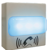
011288 Auxiliary RGB (Multi-Color) Strobe Kit