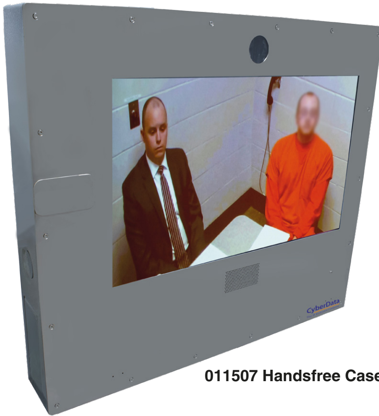
011507 Handsfree Case