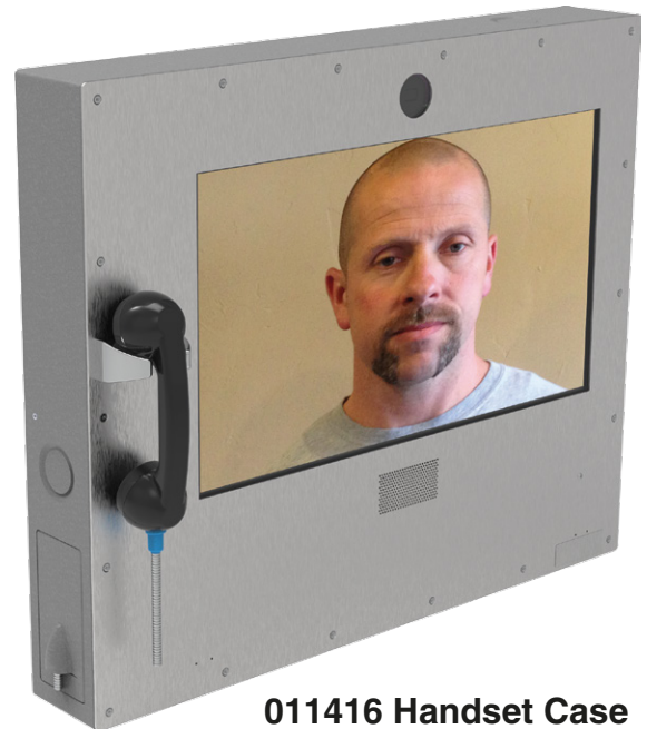
011416 Handset Case

Note: When this secure phone case is used, the touch screen capability of the DX video device is disabled.