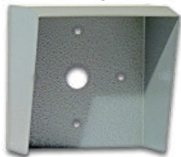
Outdoor Intercom Shroud #011188

The following related products are also available (sold separately):