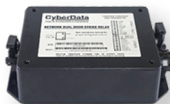
Network Dual Door Strike Relay #011375