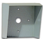
Outdoor Intercom Shroud #011188

The following related products are also available (sold separately):