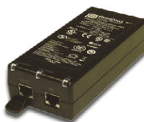
011124 PoE Power Injector 802.3at