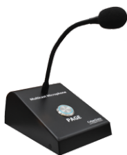
011446 Multicast VoIP Microphone