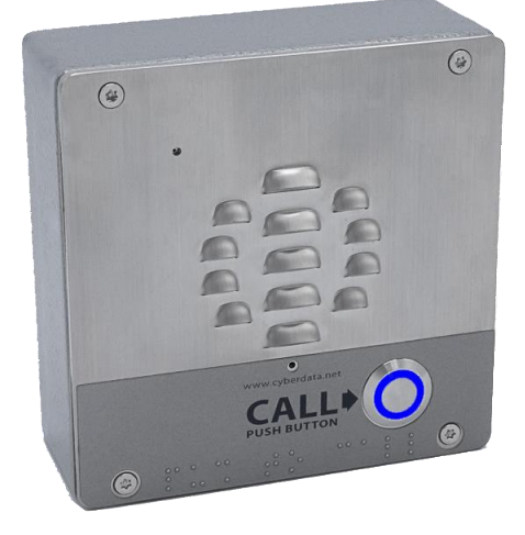
011186 SIP Outdoor Intercom