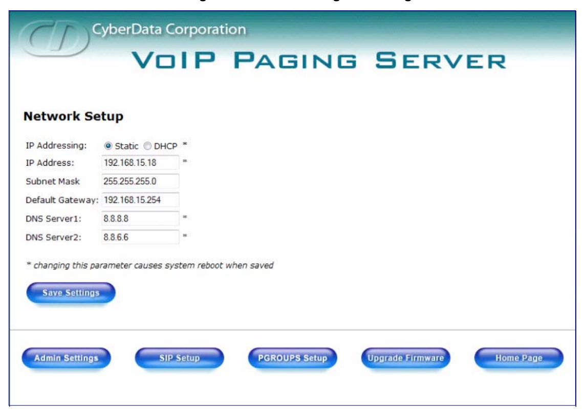
Figure 3. Network Configuration Page

The Network Configuration screen can be used to enable DHCP or assign static network addressing for this device. If DHCP is enabled, the device has a mode to enunciate its IP address information to the user after invocation.