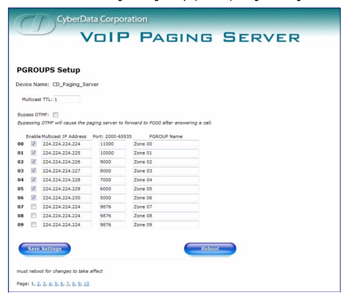
Figure 5. Page Groups (Multicast) Configuration Page

PGROUPS Setup is used to create Multicast associations for other paging devices in this network for use in zone paging. The particular zones are defined on this screen and then each respective paging device uses its Multicast Configuration screen to create the association using the defined Multicast IP addresses and ports created here. Essentially by doing this, the device listens to all packets and reacts to those having the multicast information matching that defined above.