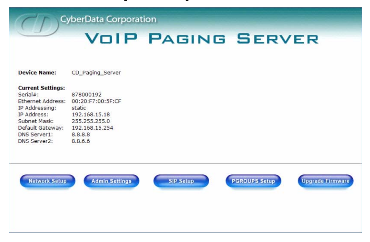
Figure 2. Home Page

Following CyberData's setup instructions, the screen above shows the home screen for the Paging Server that has been interfaced with the eConn IP-PBX and connected to the network using DHCP. This screen is accessed by browsing to the IP address associated with this device and shows Network information as well as registration status. The device's configuration screens may be password protected.