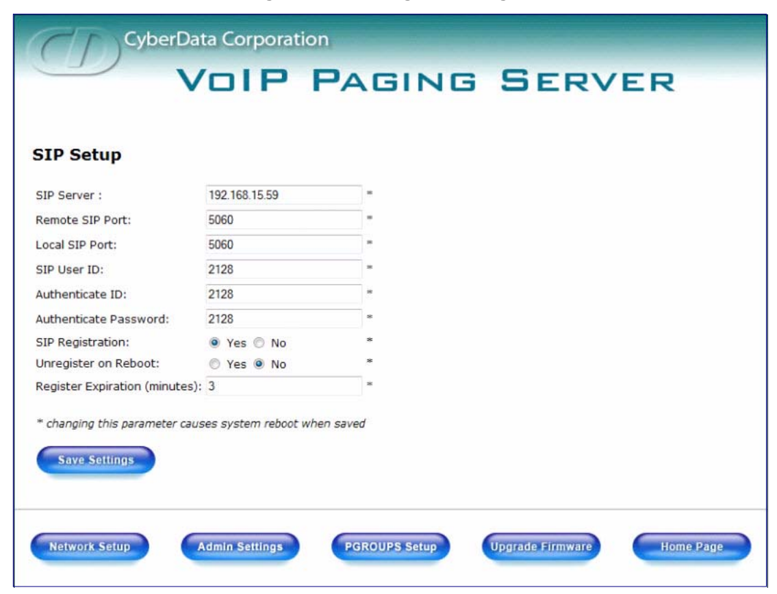
Figure 4. SIP Configuration Page

The SIP Configuration page is used to specify the IP address and port of the eConn IP-PBX as well as the prime extension that it will use in registering to the PBX. Registration Expiry timer is found here as well and should be set to a value less than set in the host PBX.