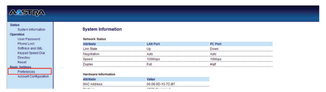
Figure 1. Click on Preferences

In the Paging Listen Addresses box, enter up to five IP addresses and ports of the multicast addresses you would like to listen to, separated by commas.