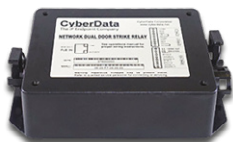
011375 Network Dual Door Strike Relay