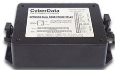
011375 Network Dual Door Strike Relay