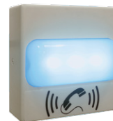
011288 Auxiliary RGB (Multi-Color) Strobe Kit