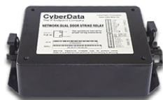
011375 Network Dual Door Strike Relay