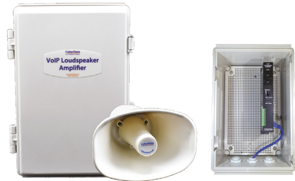
The optional 011471 IP66 Analog Horn is sold separately.

The loudspeaker enclosure is made of a UL compliant, flame resistant, impact-rated, IP66 enclosure for harsh environments.