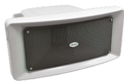
011457 SIP IP66 Outdoor Horn