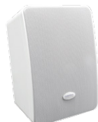
011487 Multicast Wall-Mount Speaker