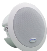
011458 Multicast Ceiling Speaker