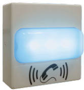
011376 SIP RGB (Multi-Color) Strobe