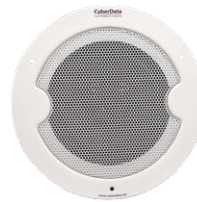
011121 Auxiliary Analog Speaker