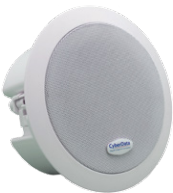
011511 VoIP SIP/Multicast Ceiling Mount Speaker