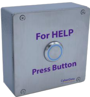
IP65 Rated! PN# 011491 SIP Outdoor Call Button