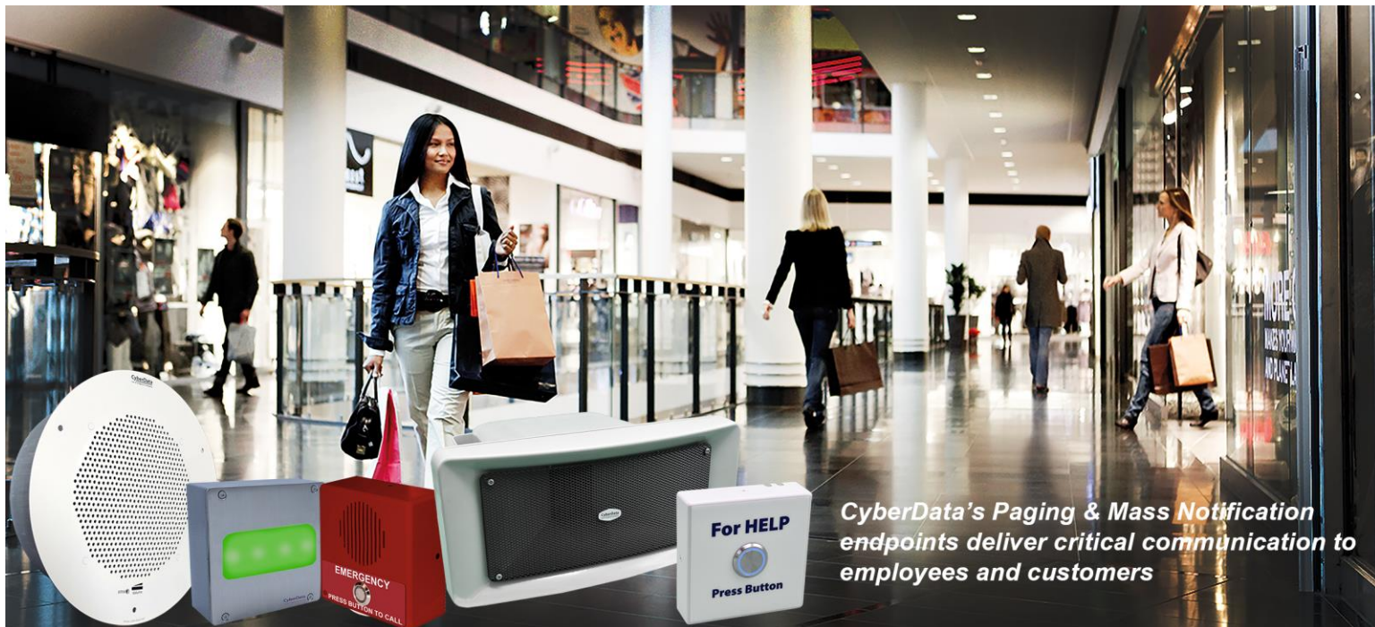
CyberData's Paging & Mass Notification endpoints deliver critical communication to employees and customers

Critical communication to employees and customers is easy with CyberData's SIP-enabled IP Endpoints. Call Buttons for assistance, Loud Horns in parking lots and garages, and Speakers throughout stores deliver critical communication, providing a safer environment for everyone.