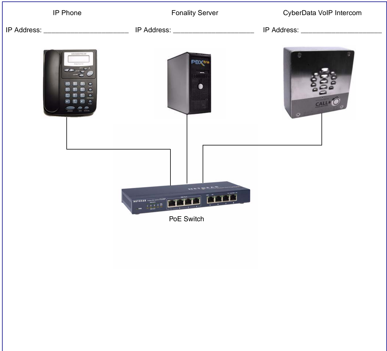
Figure 1. Setup Diagram

Figure 1 is a setup diagram for a single Intercom configuration. In this configuration, the Intercom acts as a standalone SIP telephony device.